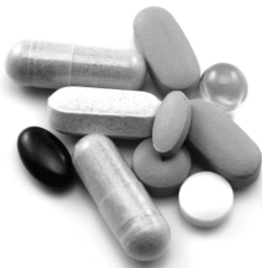
Figure 1. Medications and Supplements

Consumers are exposed to nanoparticles daily, without even realizing it, from natural sources as they are present in soot and many living and non-living entities in nature. Nanoparticles such as titanium dioxide (TiO 2 ) and zinc oxide are used in sunscreens and cosmetics. Titanium dioxide is also used as a food additive to whiten creamy products such as salad dressings, and it is used in candies and non-dairy creamers. 6 Nanomaterials are internalized by ingestion of food, medication or supplements that contain microparticles (Figure 1). Silicates and aluminosilicates are added to food products as an adsorbent to prevent caking. The average person ingests approximately 1012 submicron-sized particles each day in the form of food additives. 6