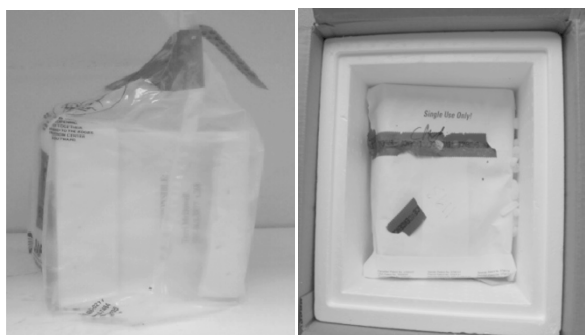
Figure 1. Examples of compromised evidence tape. When an adequate amount of dry ice was used to refrigerate a drill specimen, the evidence tape on the packaging had a tendency to become non-adhesive and shatter.

shatter when an adequate amount of dry ice was used to refrigerate a drill specimen. This is of particular concern in that had the package contained an actual specimen for submission, such evidence tape issues would have severely compromised the legal intention of chain of custody (Figure 1).