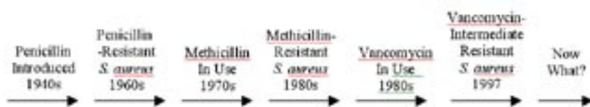
Figure 2. Timeline of the Development of Antibiotic Resistance in Staphylococcus aureus