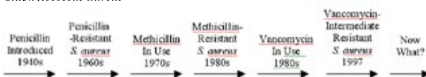
Figure 2. Timeline of the Development of Antibiotic Resistance in Staphylococcus aureus