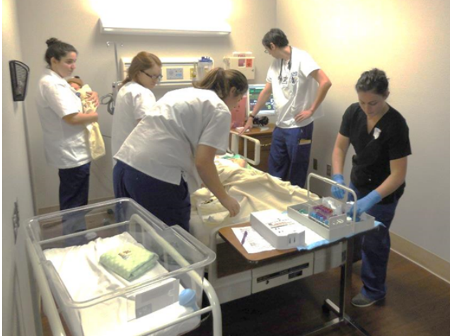
Figure 1. Students respond to patient Jenny Jones during the nursing SIM lab event

faculty by phone. Two CLS student actors were assigned to collect a blood sample when called. The patient Jenny Jones was a Laerdal manikin. Figure 1 shows the student actors during the SIM.