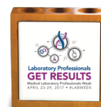
Pencil Holder #30254 $18.99