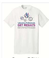
Sponsor T-Shirt #25197 $14.99