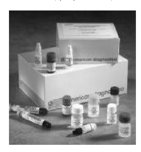
American Diagnostica Hemostasis Controls

American Diagnostica offers an extensive line of clinical laboratory products. Among its most recent offerings are its Imubind®/ELISA-based test kit for the quantitation of activated human factor VII(fVIIa) in plasma, as well as in cell culture supernatants; a line of optimized test kits for the determination of Thrombin Activatable Fibrinolysis Inhibitor (TAFI); and an extensive offering of hemostasis reference, deficient, and control plasmas to support the needs of clinical laboratory scientists. The company also offers a broad line of control materials for anti-phospholipid antibody testing. Contact Robert Trinka, (203) 602-7777, ext 31.