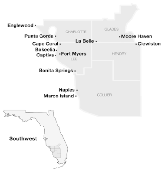
Figure 1: Counties of Southwest Florida in FGCU coverage area

The majority of the initial class were post-baccalaureate students. These students came from the ranks of the biology and chemistry graduates who were finding it difficult to secure jobs. Because Florida has a rigorous licensure requirement, most of these recruits were forced to settle for phlebotomy or pre-testing job duties, since they had no clinical training as part of their degrees. Gradually, the number of undergraduate students rose. The total number of enrolled students, including both post-baccalaureate and bachelors degree seeking students, held at about 10-15 per year.